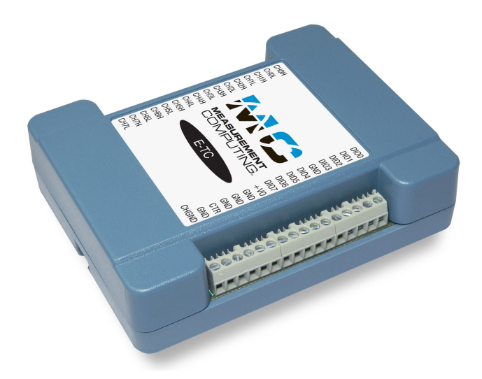
The E-TC devices offers eight thermocouple channels and eight DIO channels which are bit-configurable for input or output. Output bits can be further configured as thermocouple alarms.