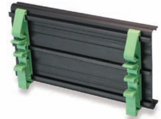
DRM, DIN-rail mounting adapter