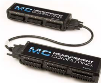
USB-1616HS-2 attached to a AI-EXP48 expansion device by a CA-96A cable