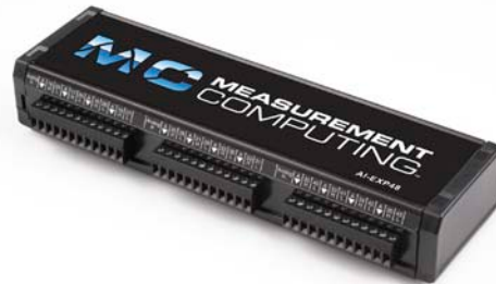
AI-EXP48, analog input expansion device