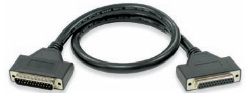
CA-96A, USB-1616HS Series to AI-EXP48 cable