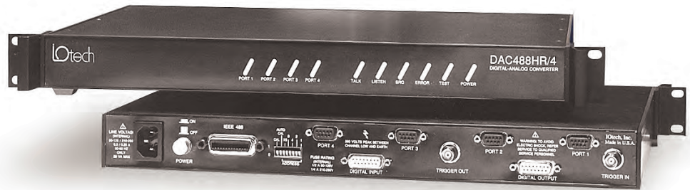
The versatile DAC488HR/4 functions as a voltage source, function generator, and an arbitrary waveform generator

Waveforms captured by IOtech's 16-bit, 100 kHz ADC488/A Series digitizers can be edited and transferred to the DAC488HR/4 for output. The ADC488/A Series and DAC488HR/4 in combination form a powerful waveform I/O system. Typical applications include transducer simulation, disk-drive testing, vibration analysis, and materials testing.