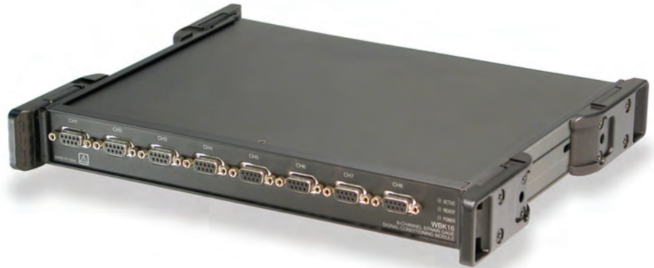
The WBK16 provides eight channels of strain gage input for the WaveBook

Excitation Source. The WBK16's excitation source is accurate to \pm 5 mV with very low drift over time. The dual excitation sources are set through software for 0.5, 1, 2, 5, and 10 volt excitation, and can be used in either a standard or 6-wire Kelvin configuration. Each channel is individually current limited to 85 mA to protect against accidental shorts. In most applications, to eliminate the problems associated with bridge overheating, you will want to select the lowest possible excitation voltage which yields satisfactory results.