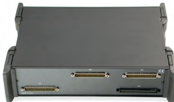
Rear view of DBK214 showing all connections to the A/D host