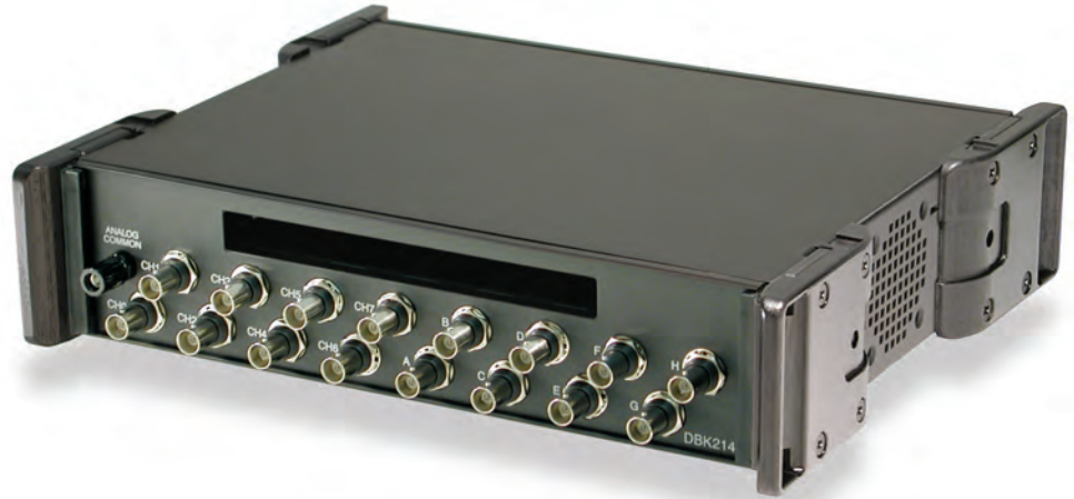
The DBK214 provides 16 BNC inputs or outputs, and internal screw-terminal connections

The DBK214 can also be used with any DaqBook, DaqScan, DaqLab, or LogBook Series product. The DB37 P1, P2, and P3 connectors on the DBK214 connect these products to the DBK214. Multiple CA-37-1 or CA-255-4T cables are used to connect each P1, P2, and P3 port on the DBK214 to the P1, P2 and P3 ports on the main A/D unit. A separate cable is needed to connect each port.