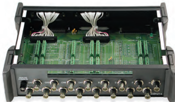
DBK214 shown with cover removed, providing access to all screw terminals