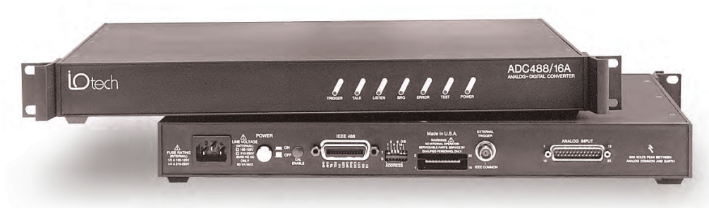
ADC488/16A provides many of the features found in expensive digital oscilloscopes

With a 100 kHz sample rate, the ADC 488/16A can capture repetitive signals with bandwidths up to 50 kHz and transients as fast as 20 us. Scan intervals from 10 us to 50s provide the flexibility to meet both high-speed transient and low-speed data logging applications. Because the ADC488/16A can function as both a high-speed, digital voltmeter (DVM) and a low-speed, digital storage oscilloscope (DSO), it lets you acquire a wide range of signals with a single device.