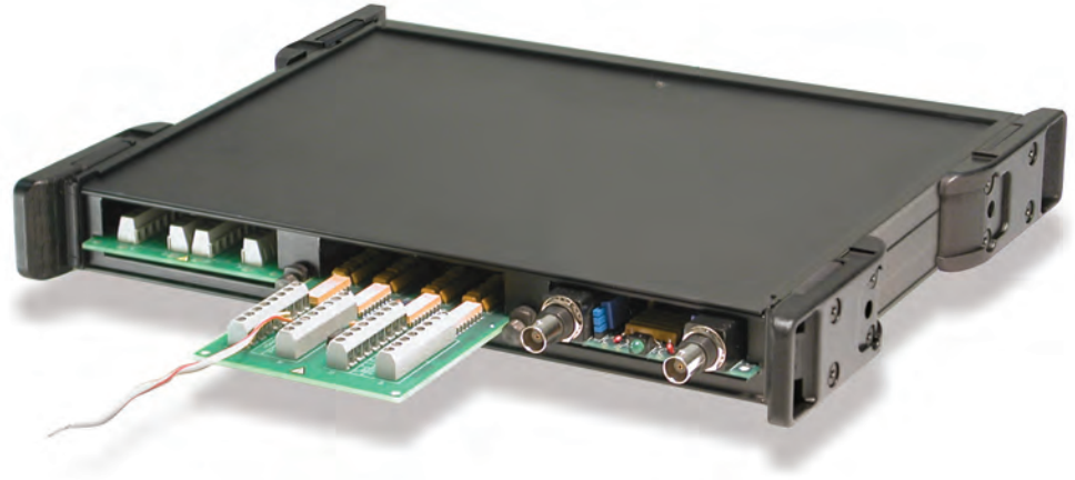
The DBK10 provides three slots for IOtech's DBK expansion cards

Weight: 1.3 kg empty (3 lbs); cards 0.25 to 0.75 kg each (8 to 12 oz)