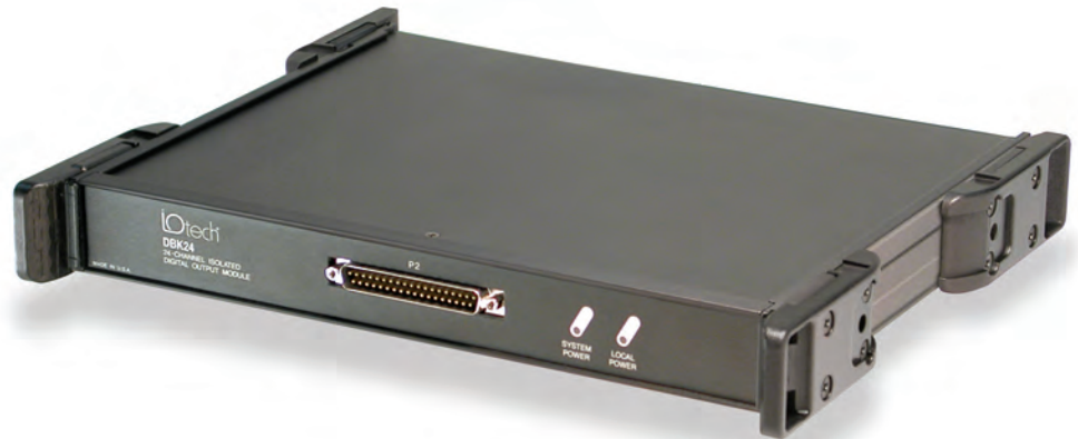
The DBK24 adds 24 isolated digital outputs to the LogBook, DaqBook, DaqBoard/2000 Series, and DaqScan

Power. The DBK24 is equipped with an internal power supply and external AC adapter. It can also be powered from a DBK30A battery module, a 12V car battery, or from any 9 to 24 VDC source.